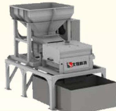
Magnetic Rollor Separator

Drum in housing separators are always installed below free-fall chutes or vibratory chute which deal powders, granulates, or coarser product streams (non-sticky). Continuously and automatically separate iron or steel from different materials. When material is fed by vibrating chute, the drum separator is easy to separate out the weak magnetic material, such as martensitic stainless steel, and even paramagnetic particles.