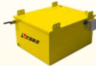
Suspended Electromagnetic Magnets

Suspended permanent magnets can couple with various of belt conveyors, vibration conveyors or chute to remove large pieces of iron from moving materials to purify materials and protect downstream equipment.