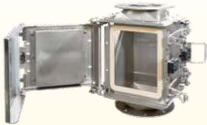
Plate House Magnet

The stainless steel housing, two plate magnets mounted on both sides and the center drawer constitute the plate house magnet. A typical deep reach magnet separator utilizes two large magnets on each side of a chute to grab large tramp metal as it passes through the stainless steel housing. The plate house magnet is designed for products that are easy to bond or bridge.