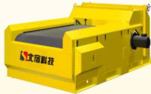
Eddy Current Separator (ECS)

Eddy current separators (also called copper and aluminum separators, non-ferrous metal eddy current separators) are equipment for separating non-ferrous metals, is also the most advanced magnetic separation equipment. They are widely used to separate non-ferrous metals in recycling resources and other industry. In recycling industry, Eddy current separators usually cooperate with other sorting equipment to separate high purity and high quality recycling products.