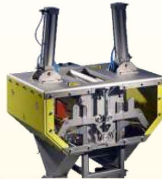
Self-Cleaning Plate House Magnets

The stainless steel housing, two plate magnets mounted on both sides and the center drawer constitute the plate house magnet. A typical deep reach magnet separator utilizes two large magnets on each side of a chute to grab large tramp metal as it passes through the stainless steel housing. The plate house magnet is designed for products that are easy to bond or bridge.