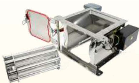
Rotary Grate Magnet

Rotary grate magnetic separator, also called Rota grate magnet, is designed for sluggish materials. It is mainly used to remove miscellaneous iron from materials, such as easily bonding or bridging, and prevent material from packing and plugging up the processing line. The easy-to-clean rota-grate magnet make the iron cleaning more easily by adding double-layer stainless steel sleeve on magnetic bar surface. When cleaning, manually or automatically separate the non-magnetic sleeve and magnetic element to achieve quickly iron unloading.