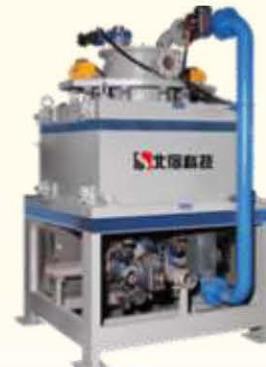
Slurry Electromagnetic Filters

Dry powder electromagnetic separator can provide high-gradient magnetic separation to fine iron powder at a high capacity product flow. They are always used to effectively remove fine ferromagnetic or paramagnetic pollutants contained in raw materials so as to obtain high-grade materials in the ppm ~ ppb level.