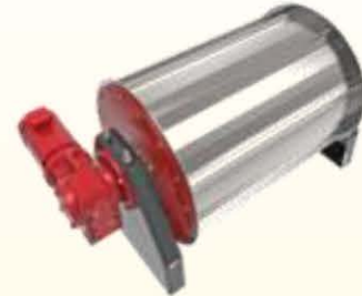
Permanent / Electro Magnetic Drums

The Magnetic Head Pulley is widely used in belt conveyors for continuous automatic removal of damaging tramp iron from a variety of non-magnetic materials in many industries. The pulley is mainly used to effectively sort large pieces of magnets, maximally protecting downstream equipment from damage and realizing automatically iron removal.