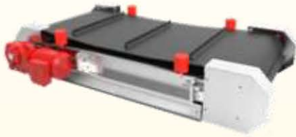
Suspended Permanent Magnets

Suspended permanent magnets can couple with various of belt conveyors, vibration conveyors or chute to remove large pieces of iron from moving materials to purify materials and protect downstream equipment.