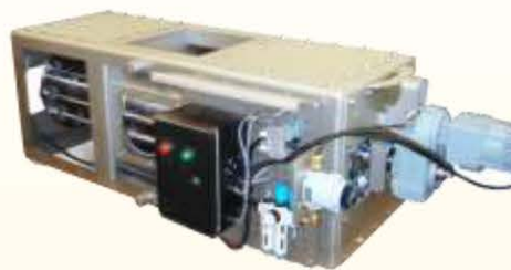
Self-Cleaning Rota-Grate Magnet

Rotary grate magnetic separator, also called Rota grate magnet, is designed for sluggish materials. It is mainly used to remove miscellaneous iron from materials, such as easily bonding or bridging, and prevent material from packing and plugging up the processing line. The easy-to-clean rota-grate magnet make the iron cleaning more easily by adding double-layer stainless steel sleeve on magnetic bar surface. When cleaning, manually or automatically separate the non-magnetic sleeve and magnetic element to achieve quickly iron unloading.