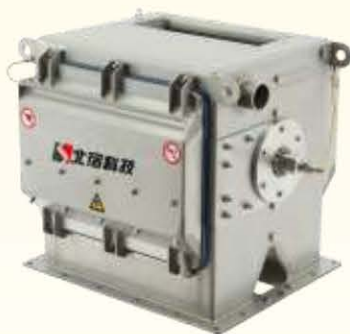
Drum In Housing Separators

The Permanent / Electro Magnetic Drum is always used in resource recovery, mineral treatment, recycling materials and other industries in conditions which need to obtain high purity material. The drum magnets are mainly used to effectively sort large pieces of magnets or fine ferromagnetic particles, and realizing automatically iron removal.