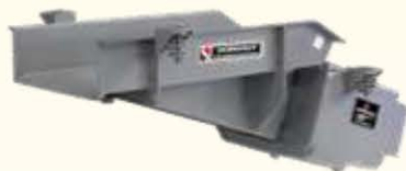
Heavy Duty Electromagnetic Vibratory Feeders

Heavy duty electromechanical feeders are always used to deal with the heavy-weights of bulk material and satisfy the higher capacity requirements. Heavy duty electromechanical feeders are two-mass, spring-connected and sub-resonant-tuned. The exciter unit is connected to the trough with corrosion resistant polymeric drive springs. Feeding is more stable under different working conditions.