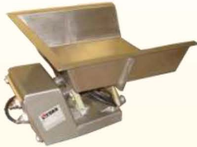
Light Industry Electromagnetic Vibratory Feeders

Used in application of material separation, screening, dehydration, and dust removal. There are 4 models which can be chosen. The unique electromagnetic permanent magnet drive makes it have a good screening effect on fragile materials. A variety of screens are available, including metal wire woven mesh, special-shaped wire mesh, etc. For special materials, special stepped screens can be designed. Dust-proof and waterproof sealing cover can be used for the material tray.