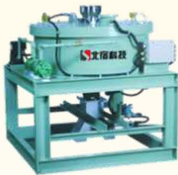
Dry Powder Electromagnetic Filters

Suspended electromagnetic separators are mainly used in conveying systems to protect downstream crushers, grinders and other mechanical equipment to work safely and normally. At the same time, it can effectively prevent large and long iron objects from scratching the conveyor belt.