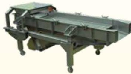
Heavy Duty Electromechanical Vibratory Feeders

Used in application of material separation, screening, dehydration, and dust removal. There are 4 models which can be chosen. The unique electromagnetic permanent magnet drive makes it have a good screening effect on fragile materials. A variety of screens are available, including metal wire woven mesh, special-shaped wire mesh, etc. For special materials, special stepped screens can be designed. Dust-proof and waterproof sealing cover can be used for the material tray.