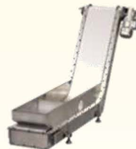
Magnetic Slide Conveyors

As an ideal choice for feeding bulk materials from storage stacks, silos, bins and silos. Our heavy-duty vibrating feeders have multiple advantages, sturdy structure and do not need frequent maintenance. It can be used in the most stringent environments, including mining, aggregates, glass, cement, chemicals and metal processing. There are two major categories of