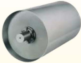
Magnetic Head Pulley

The Magnetic Head Pulley is widely used in belt conveyors for continuous automatic removal of damaging tramp iron from a variety of non-magnetic materials in many industries. The pulley is mainly used to effectively sort large pieces of magnets, maximally protecting downstream equipment from damage and realizing automatically iron removal.